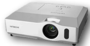
Projection System - $140