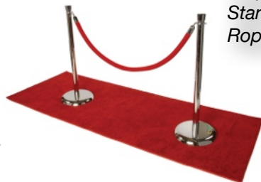
Carpet - $45 Stands - $10 Rope - $5