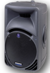
iParty Sound Packages Start $125